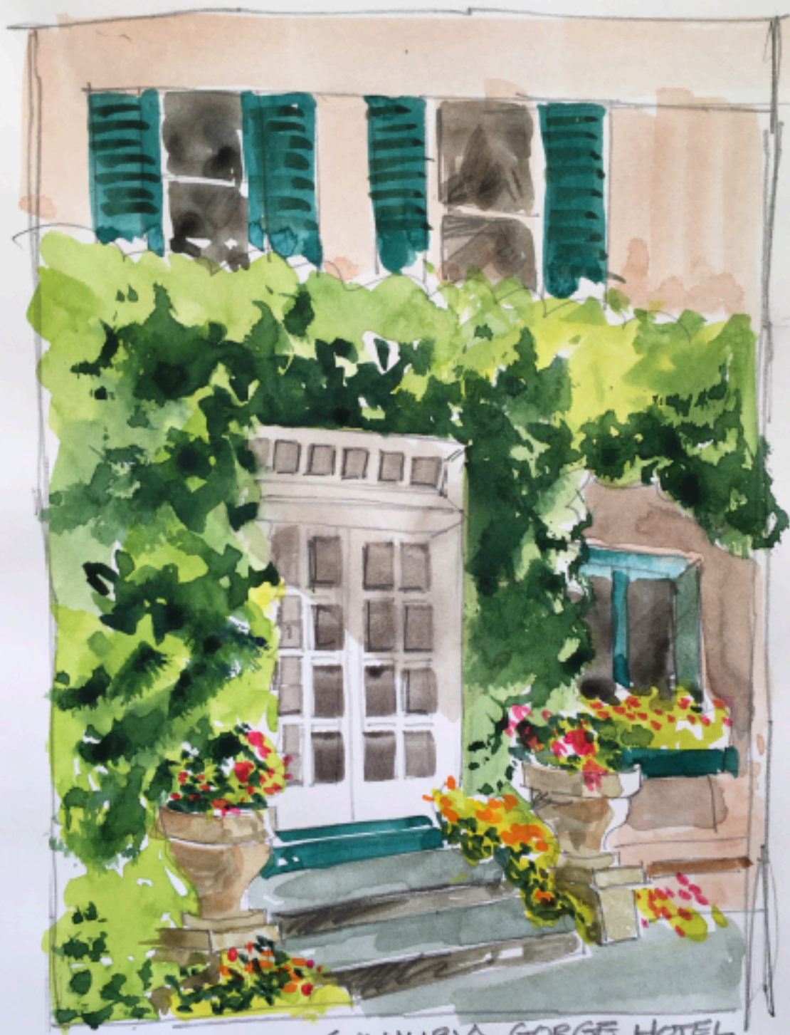
COLUMBIA GORGE HOTEL